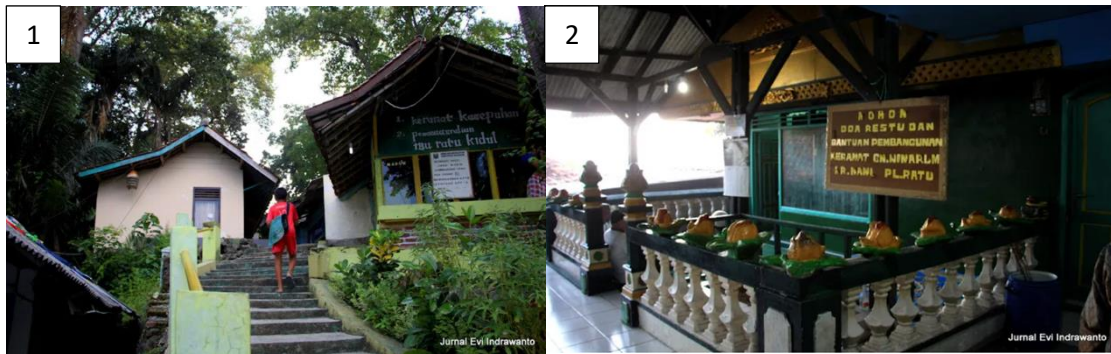
Figure 2. (1) Stairs leading to the "Puncak Winarum" and (2) location of Nyi Roro Kidul's shrine